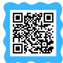
LA METRO SYSTEM MAP

LA Metro bus or rail line is always around the corner at LA City College, making it easy to get from campus without a car to Los Feliz, Hollywood, Downtown Korea town and more. Blue Line Service to, Los Angeles and Downtown Long Beach. Possible destinations include: Staples Center and LA Convention Center Watts Towers, Queen Mary and the Aquarium of the Pacific. Expo Line Service to popular destinations such as: USC, Exposition Park (including the California Science Center and Natural History Museum), Santa Monica Pier.