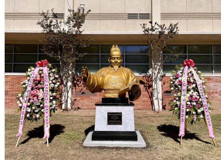
THE STATUE OF SEJONG THE GREAT (INVENTOR OF THE KOREAN ALPHABET HANGUL) AT LACC JEFFERSON HALL.

*Declare your academic goals ASAP for priority enrollment